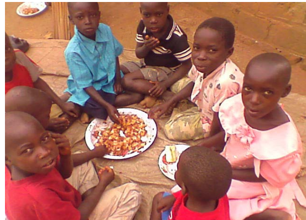
Feeding & clothing the children