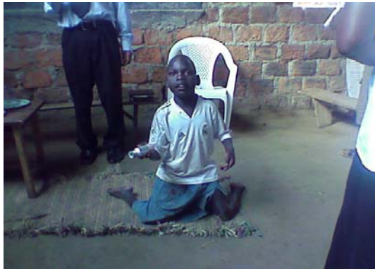
8 yr old boy always on the front row