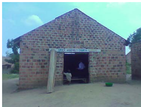
Grace Assembly Church, Kapeka