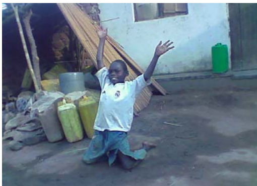
Rejoicing, his wheelchair is repaired