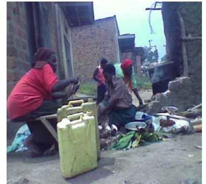
Women preparing food