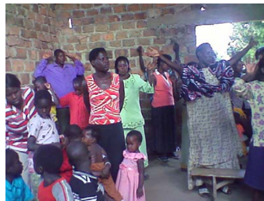
Praising and worshipping the Lord