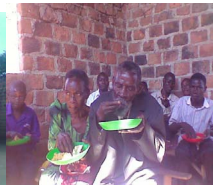
Feeding the Elderly